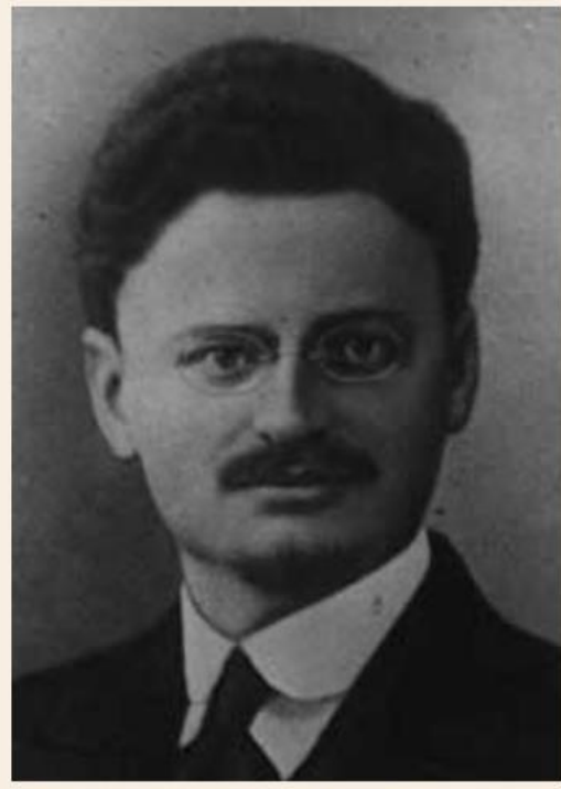
Trotsky was exiled and eventually murdered